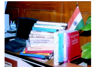
सर्वेषां पूर्णं भवतु