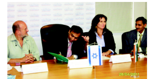
Our VC signing MOU with Israel Chamber of Commerce while leading a deligation of 54 Industrialist from ASSOCHAM